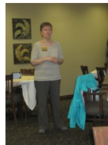
...Ev talks about radio ads and PR.