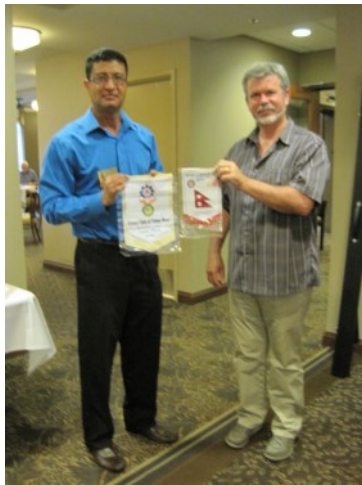
...San brought some banners back from Nepal...