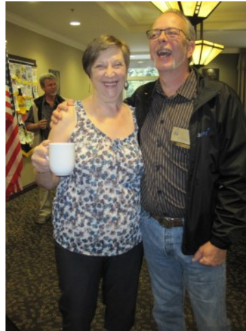
Our ever-smiling Greeters...