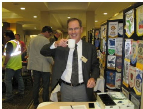
...Terry was happy to take our money!