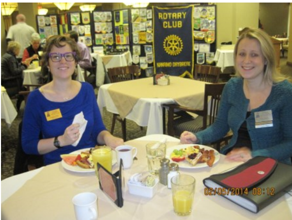
...Nothing like breakfast to put a smile on your face!