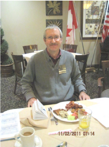
A fed Pres is a happy Pres...

Contact Kris Rongve to donate and receive your 2011 tax donation receipt.