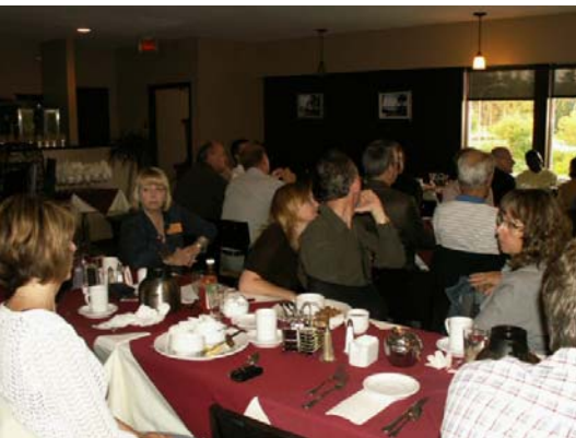
...it was actually a somewhat smaller crowd than usual at the meeting last week...