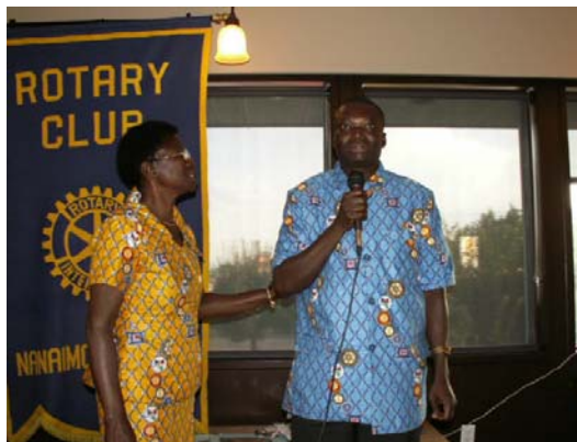
...the other two Ghana guests...