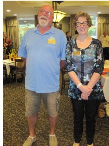
Welcome to Daybreak Rotary...