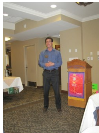
...San was back safe and sound from Nepal!

The meeting was adjourned after reciting the four way test.