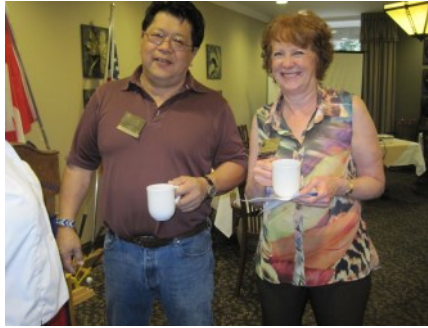
Our happy greeters will welcome you...