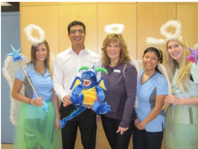
...Some more photos from "Catch A Smile" ...