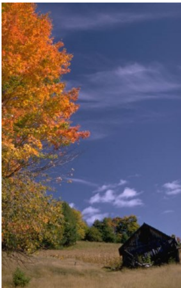
..San provided the Rotary Moment today.

That being our morning, Four Way tested and on to new adventures.