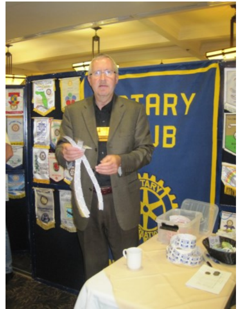
...Can I interest you in some tickets?...