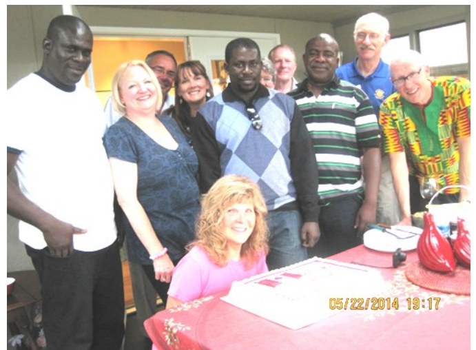
Reception for our Ghanaian visitors on the evening of Thursday, May 22, 2014.