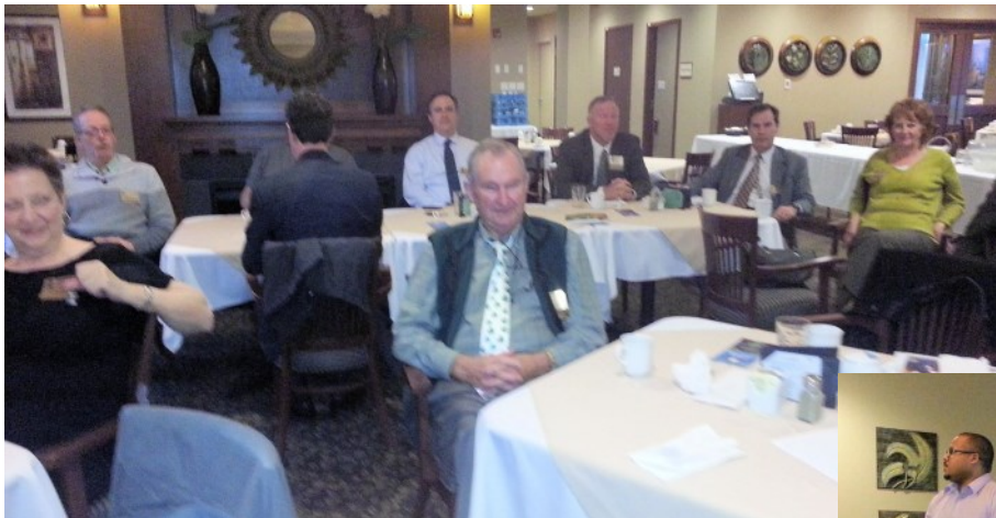
Some photos from the previous meeting.

Th th that's all as yours truly snuck out early to go cook breakkie for Travellers Lodge Society Elders.