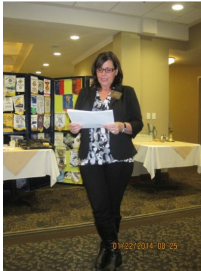
Sher gives her Rotary Minute...

Capital: Stockholm with one million people which consists of 14 islands; Present king is King Carl XVI Gustaf; Population: 9.517 million; Government: Unitary state, Representative democracy, Parliamentary system. Popular brand name like H&M comes from Sweden and