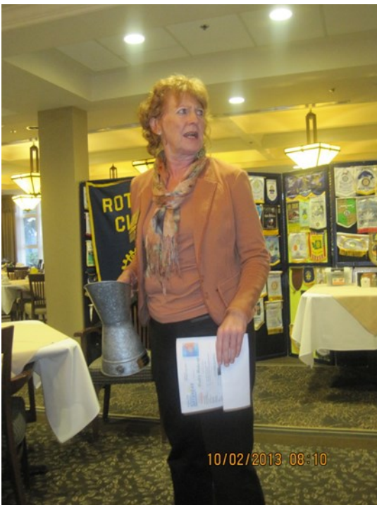
...“Where’s that Ron? I need to fine him...”

In summary, it's their belief they have expanded the relationships, participated in hands on projects and have learned of new project. The way forward will include a visit by Ghana Rotarians in 2014. Plans and volunteers are now being considered for a 2015 visit to Ghana.