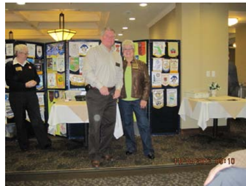
...And finally, adventures at the 50/50 table.