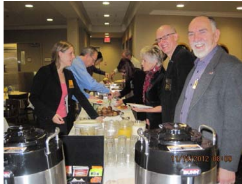
Breakfast is served...