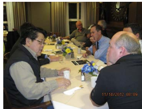
...and the boys' table is still waiting for theirs...