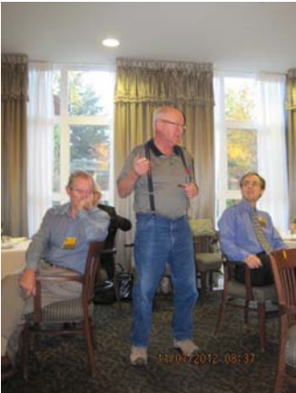
...Dress code? What dress code!...