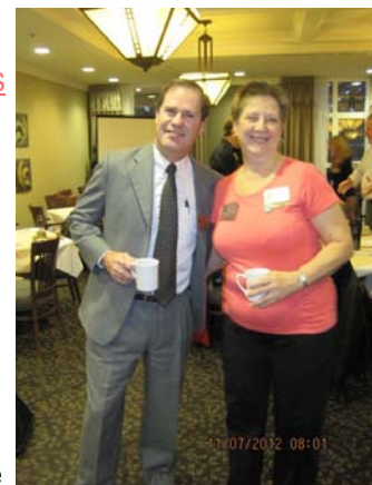
Welcome to Rotary!

We still have over 80 tickets for the Grey Cup event at Costlin Hall on Nov 25th to sell, and that's only if all of those already taken are sold. We need to sell a lot more. Chris will have the tickets available on Wednesday, but, in the meantime, could everyone talk it up with potential attendees. There will be some tickets at the door, BUT we will need numbers in order to arrange catering.