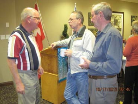
Some glum-looking greeters here...