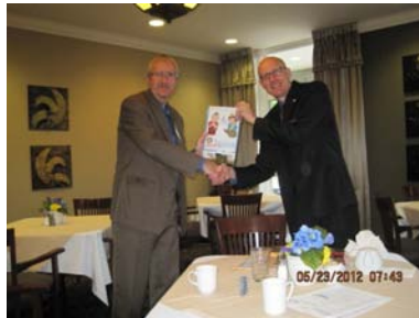
..but two new banners from Thailand clubs...