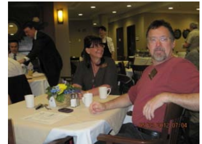
...and Robb attended for the second week in a row!!!