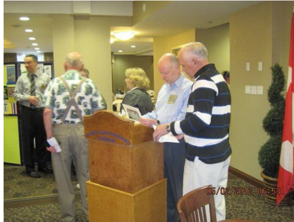
Okay, okay, I can run this thing..