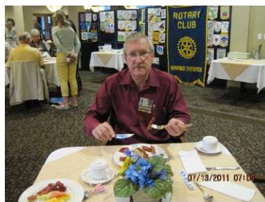
...Yea, I got bacon. What's it to ya?...