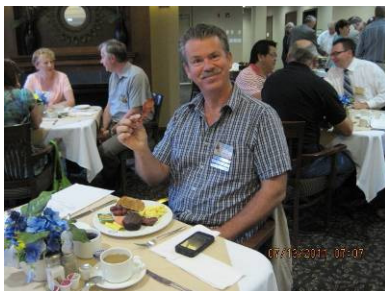
...Look! I get bacon today!!!...