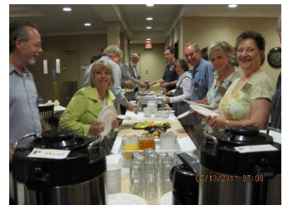
...We're just happy to finally get our breakfast. Maybe there will be bacon, maybe not...