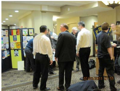
...and a couple of group shots during the meeting to finish up this week's issue.