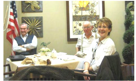
...the President's table enjoyed the meeting...

This being the third Wednesday of the month, our President shared the financial reports, noting "not much action" and the bloated numbers were from the Matching Grant for the Sunyani toilets.