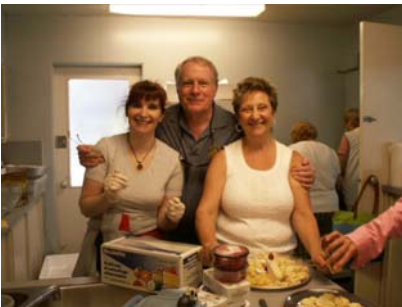
Happy kitchen elves... ;)