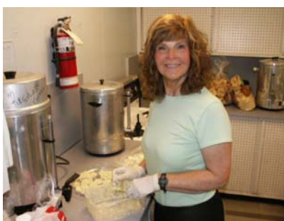
A busy President is a happy President