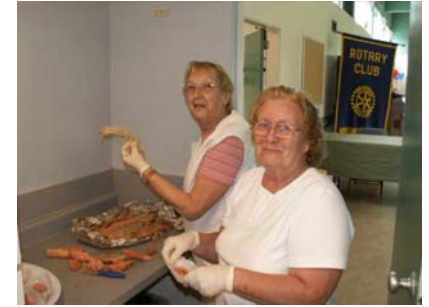
Preparing the salmon!