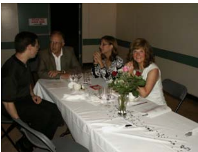
And now the fun begins...