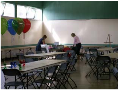
There's lots of setup to an event like this...