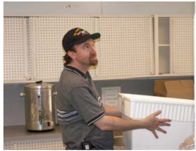
The sky is falling, the sky is falling!