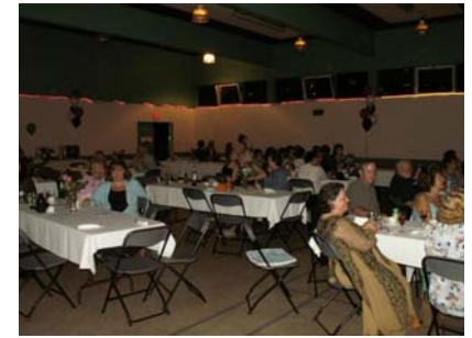
And a good time was had by all!

...and thanks to all who made this event possible!